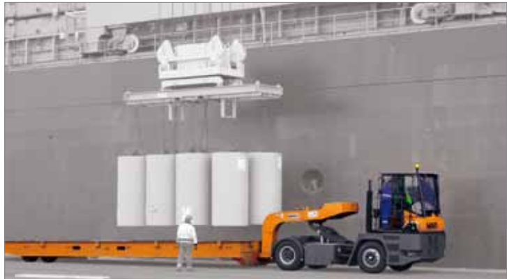
» Cargo trailer system with MAFI Tractor