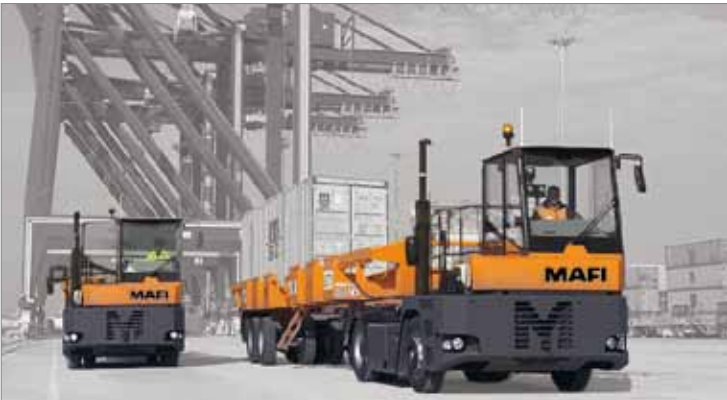
» Container chassis with MAFI tractor