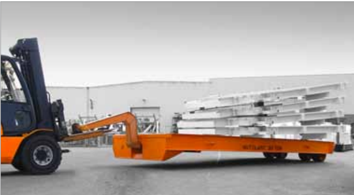
» Cargo trailer system with forklift truck