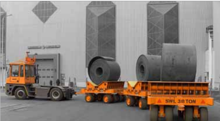
» Coil bed trailers with MAFI tractor