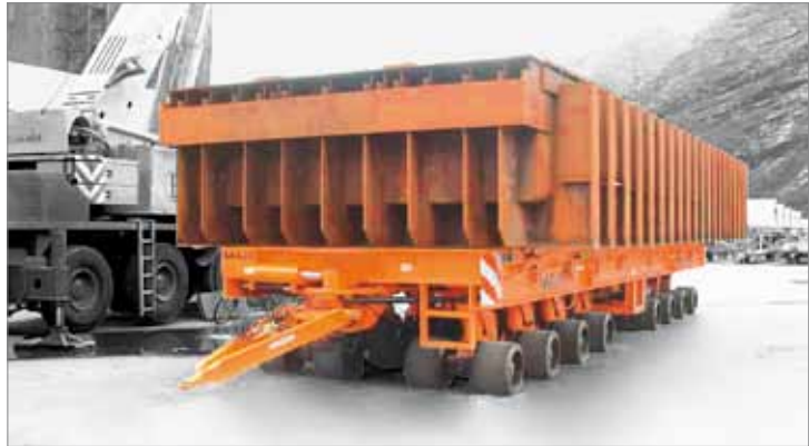
» Heavy-duty elevating trailer