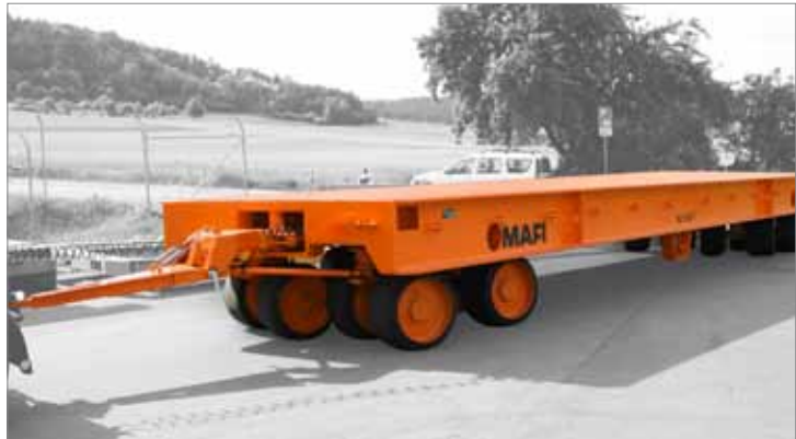
» Heavy-duty drawbar trailer